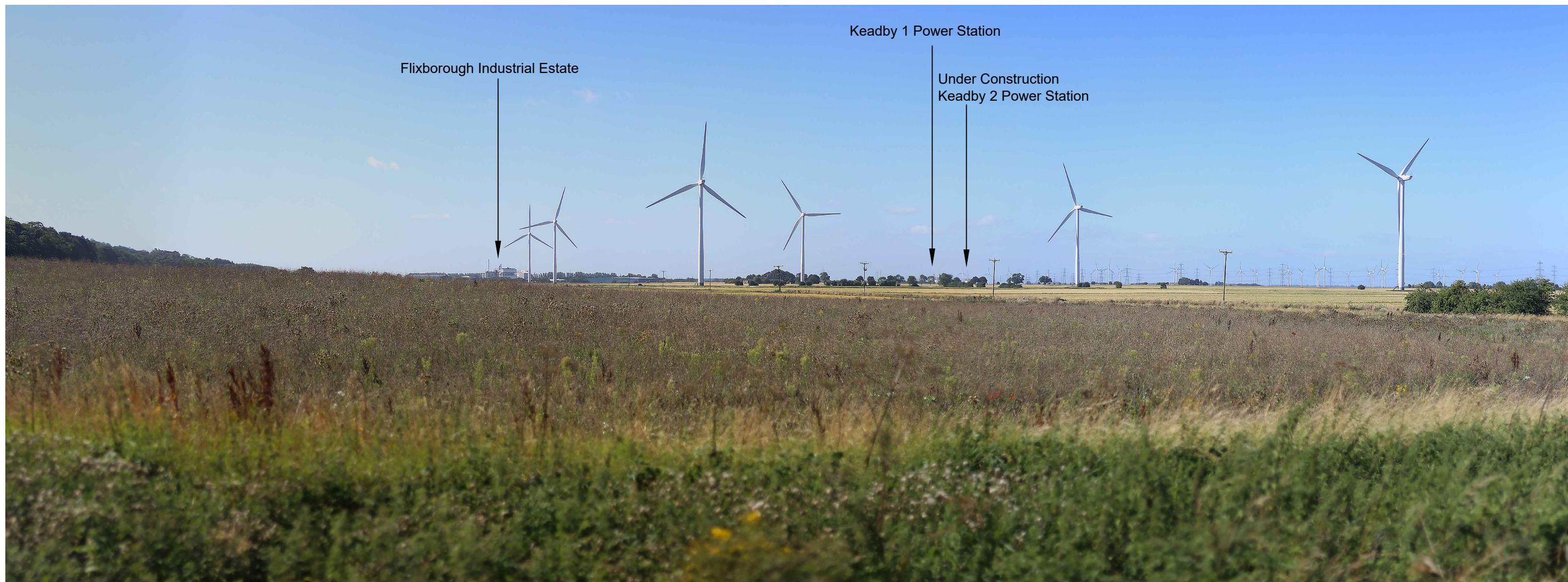
Extent of 50mm single frame image

Last saved by: BECCALITTLE(2021-05-07) Last Plotted: 2021-05-12 Filename: \UK\LDSP\PP\SW\011E_PROJECT\SW\PROJ\061625943 - SSE KEADBY AND MEDWAY DC0102 SSE KEADBY VISUAL FIGURES\KEADBY LANDSCAPE AND VISUAL FIGURES\KEADBY VIEWPOINT FIGURE\PHOTOVIEWPOINT 061625943.DWG